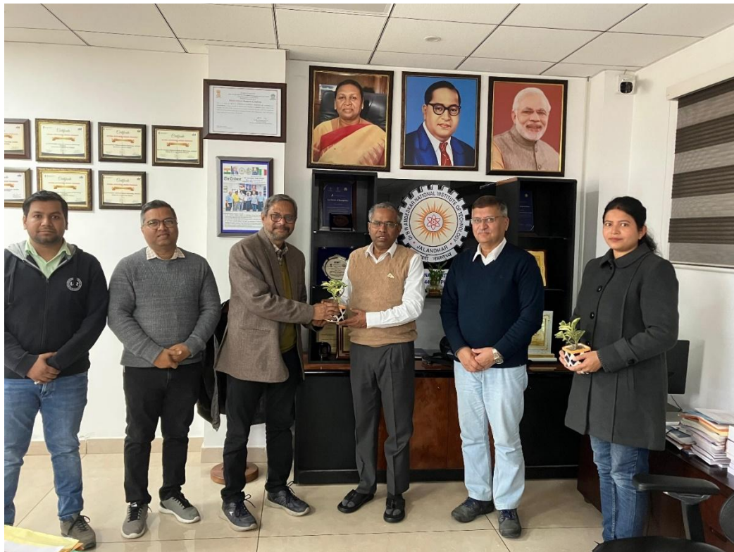
Image after Valedictory ceremony of the STC