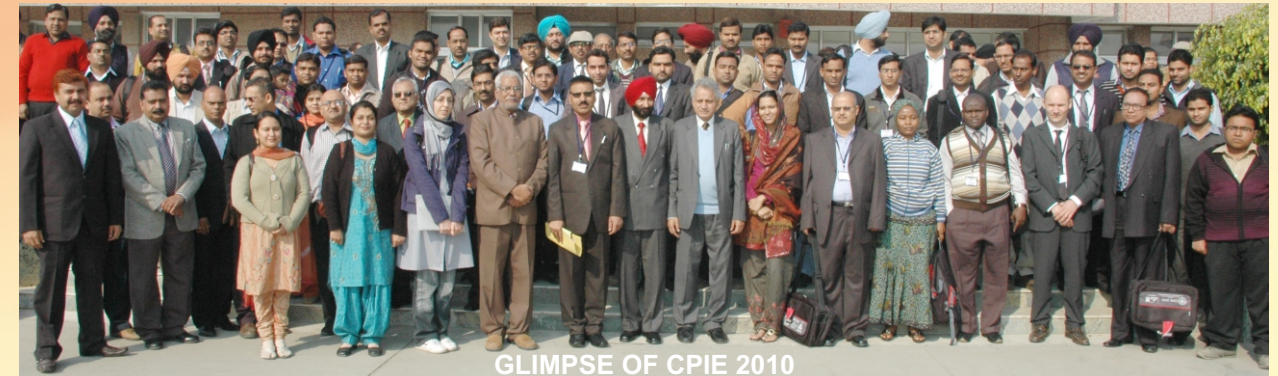
GLIMPSE OF CPIE 2010

CPIE 2019 at Dr B R Ambedkar National Institute of Technology Jalandhar