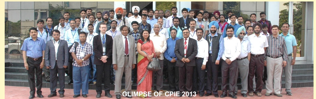
GLIMPSE OF CPIE 2013