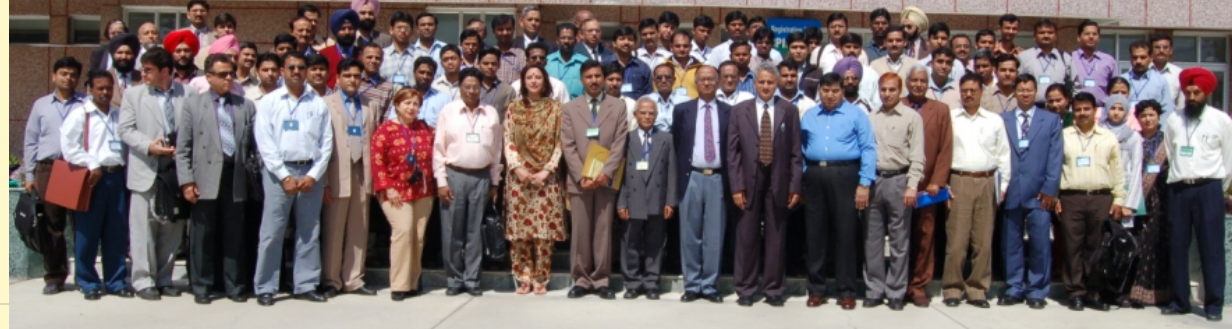
GLIMPSE OF CPIE 2007

Electronically to: Account Name: CPIE Account Number: 2945101002372 Swift Code: CNRBINBBBMC IFSC code: CNRB0002945 MICR Code: 144015011 Bank: Canara Bank , NIT Jalandhar 144011, India Or Demand Draft in favour of CPIE payable at Jalandhar