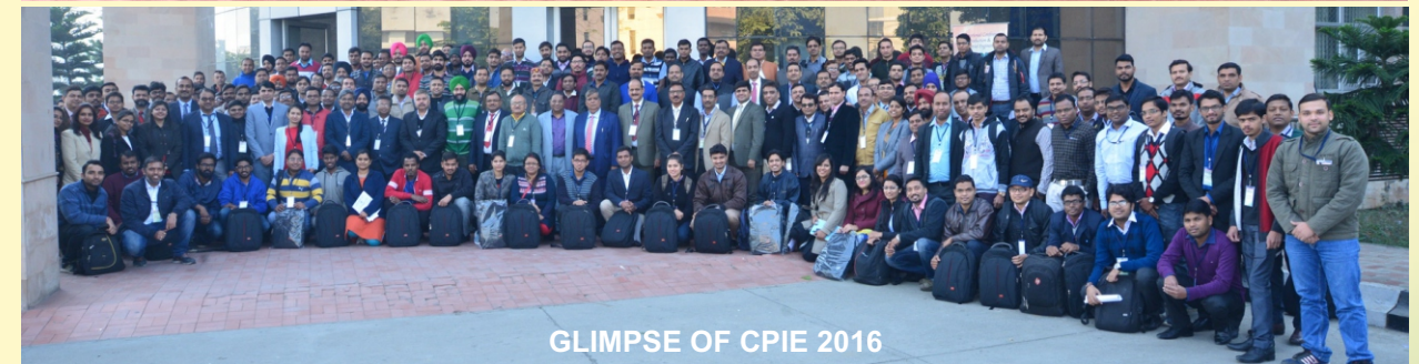
GLIMPSE OF CPIE 2016